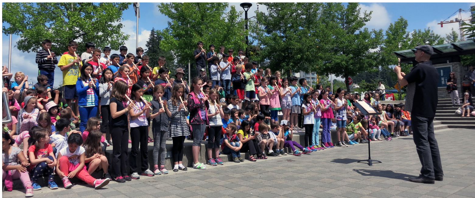
Above: University Highlands Elementary School students perform to kick off the 2014 UniverCity Summer Concert series. For more photos about what happened at UniverCity in 2014, see page 2.