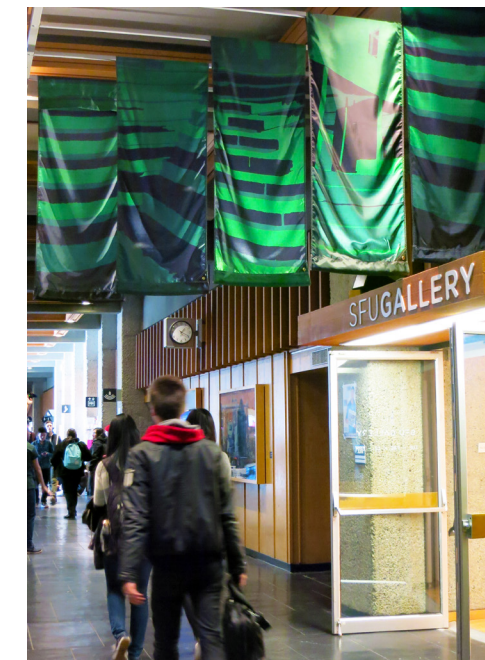
Above: SFU Gallery & UniverCity Public Art banners.

For more information, please visit: www.sfu.ca/galleries.html