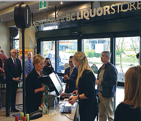
Above: First sales transaction at the grand opening of the new BC Liquor store on April 15th, 2016.

Visit http://universitycity.ca/retail-services for a full list of UniverCity shops and services.