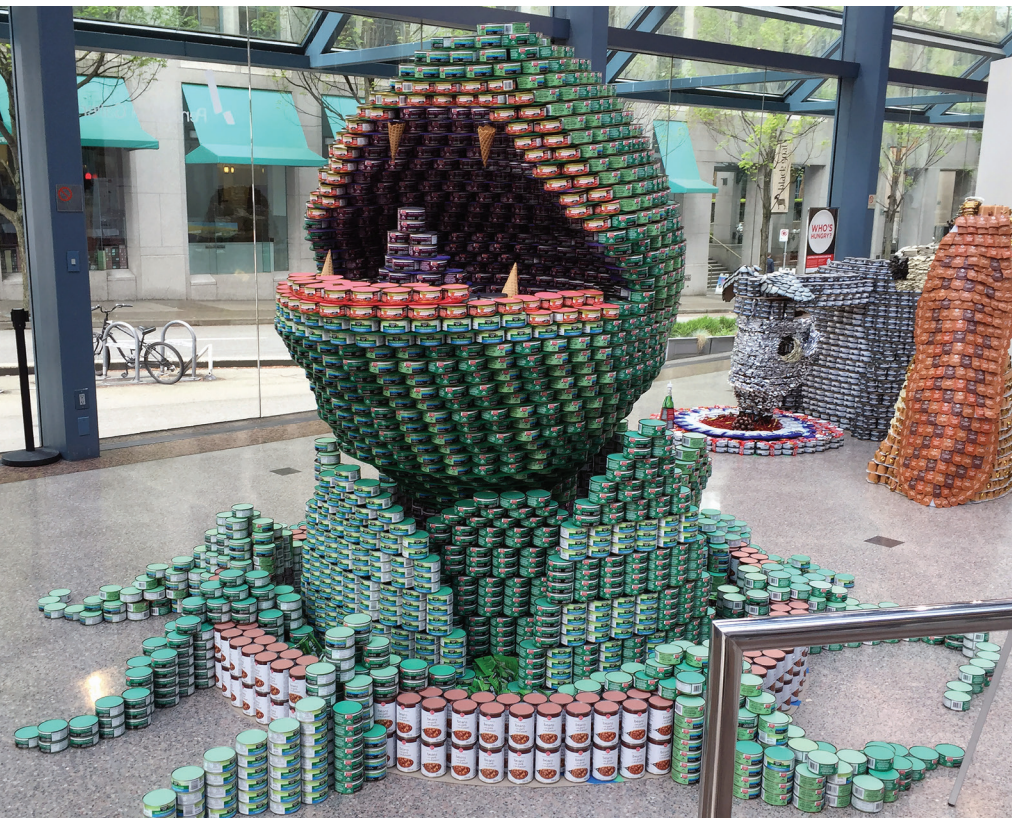
Above: CAN you believe it? UniverCity/HCMA/Fast+Epp completed another successful CANstruction Vancouver build. Our Audrey II from The Little Shop of Horrors was made out of 6,800 cans.

"Feed Me Seymour! If you feed me all day long, I can grow up big and strong!" These words spoken by Audrey II in the campy 80's film Little Shop of Horrors could be echoed by the nearly 5,500* children receiving support from the Greater Vancouver Food Bank (GBFV) each week.