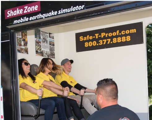
Above: Testing out the Quake Cottage 8.5 Earthquake simulator in the Town Square during the SFU Emergency Preparedness Days.