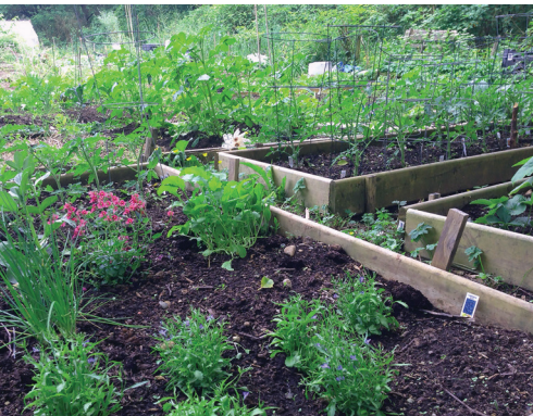
Above: Naheeno Park Community Garden plots.